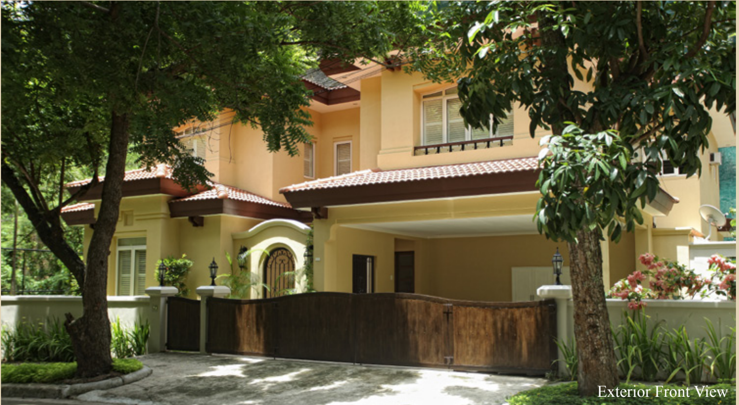
Exterior Front View