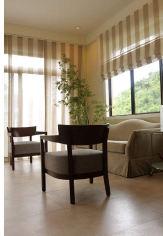
Living room & Dining area