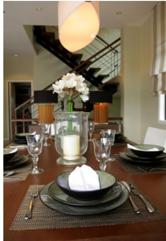
Living room & Dining area