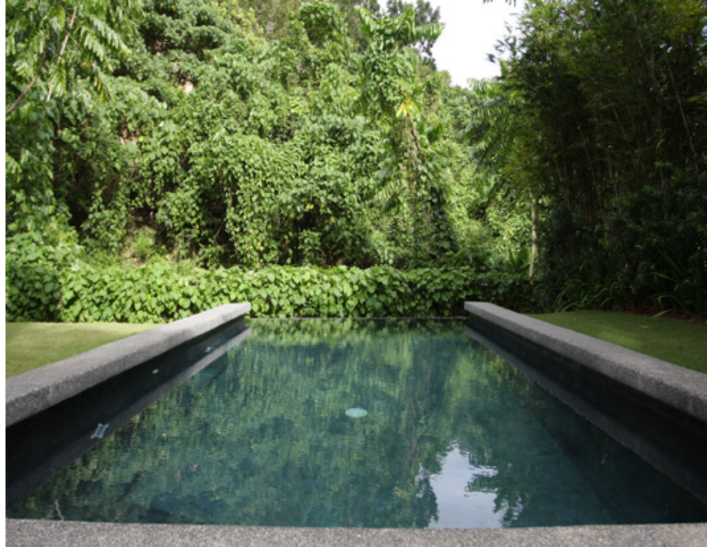
Swimming pool with tropical garden.