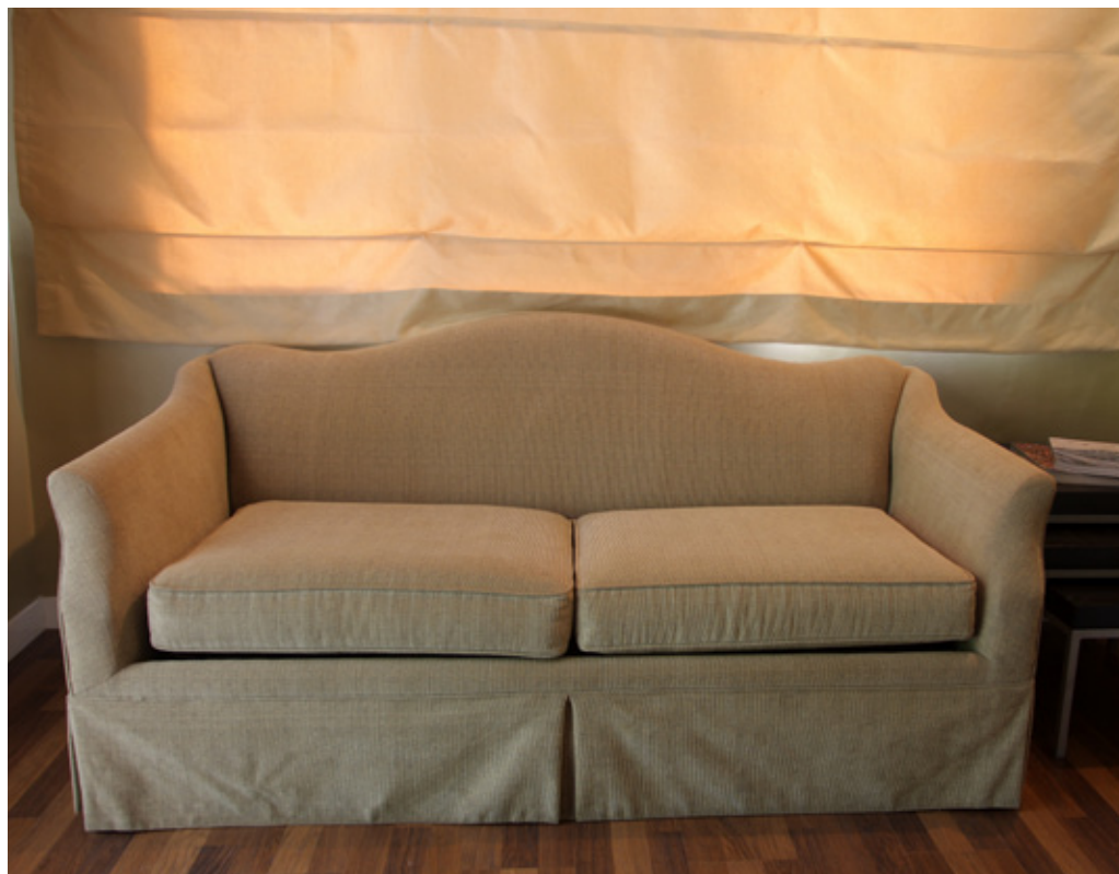
Guest room / Office with toilet