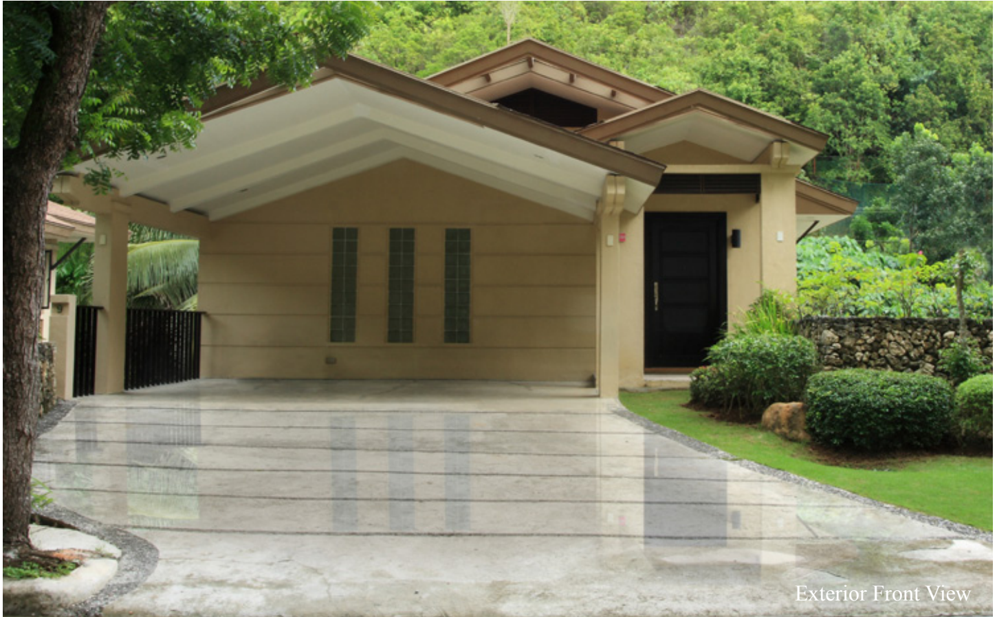
Exterior Front View

* Excludes: Transfer Tax, Documentary Stamps and Registration Fees. * Furnishing packages available upon request