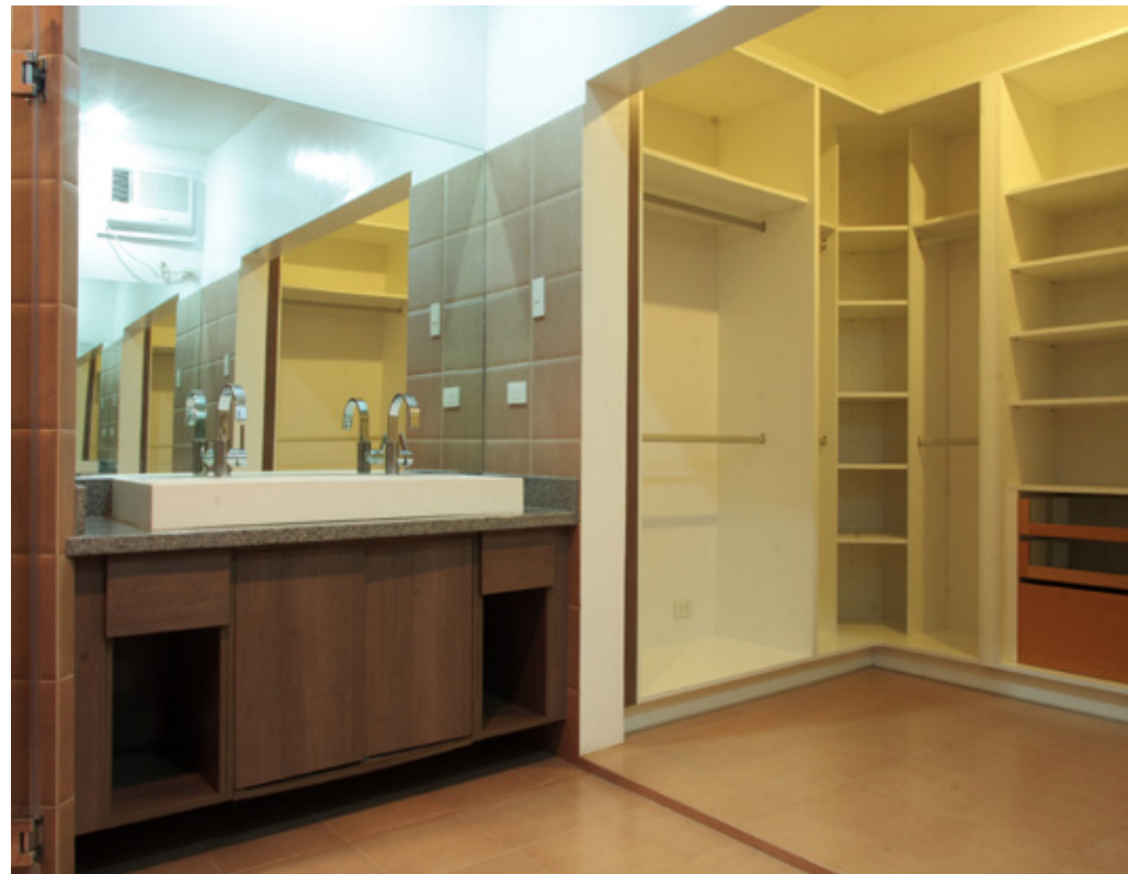
Master Bathroom & walk-in closet.